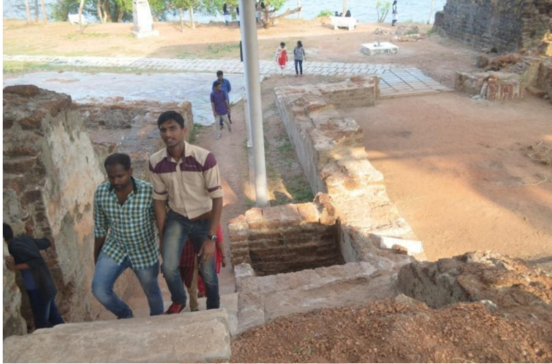
At Pallipuram Fort