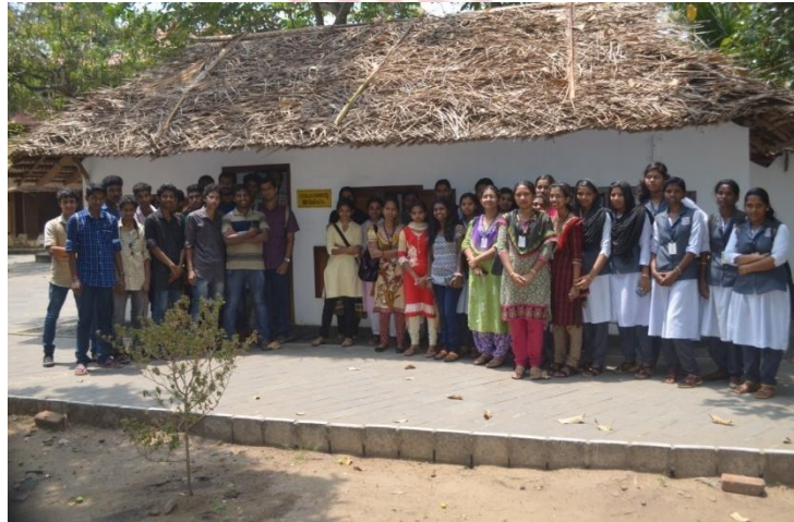
In front of Sahodaran Aiyappan's House